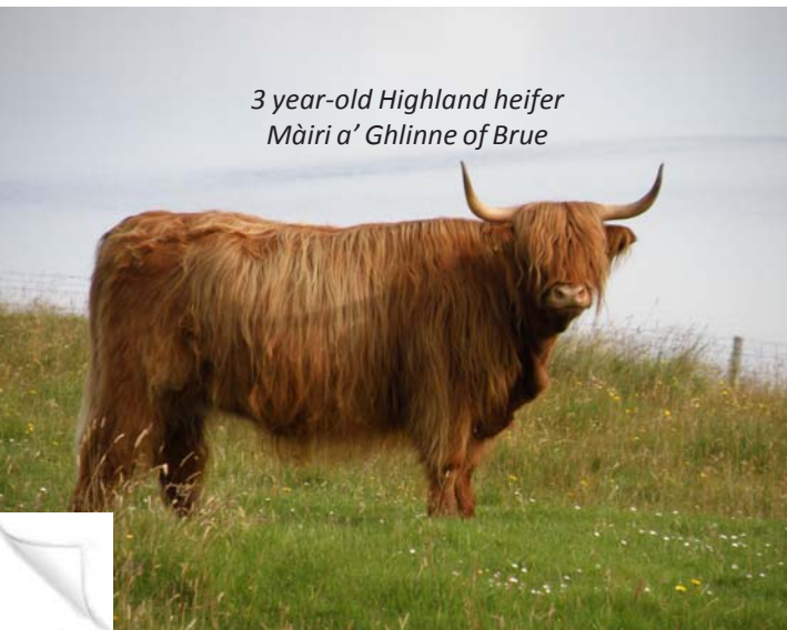
3 year-old Highland heifer Màiri a' Ghlinne of Brue

The Highland Breed of cattle has a long and distinguished ancestry, not only in its homeland in the Western Highlands and Islands of Scotland, but also in many far-flung parts of the world. It is one of Britain's oldest, most distinctive, and best known breeds and has remained largely unchanged over the centuries. Written records of the breed go back to the 18th century.