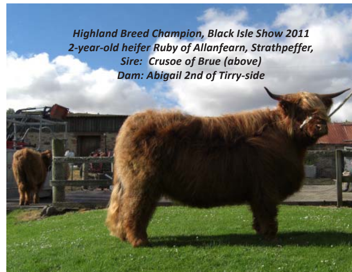
Highland Breed Champion, Black Isle Show 2011 2-year-old heifer Ruby of Allanfearn, Strathpeffer, Sire: Crusoe of Brue (above) Dam: Abigail 2nd of Tirry-side